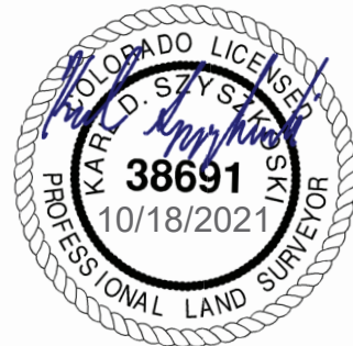
EXHIBIT ATTACHED AND MADE A PART HEREOF.