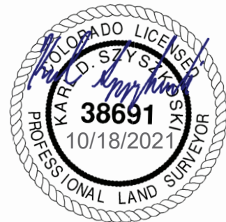
EXHIBIT ATTACHED AND MADE A PART HEREOF.