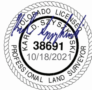
EXHIBIT ATTACHED AND MADE A PART HEREOF.