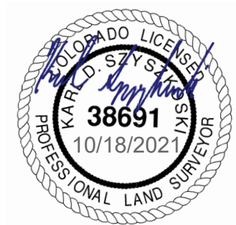
EXHIBIT ATTACHED AND MADE A PART HEREOF.