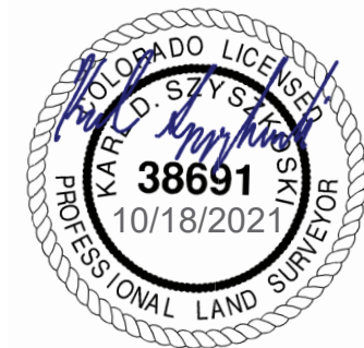
EXHIBIT ATTACHED AND MADE A PART HEREOF.