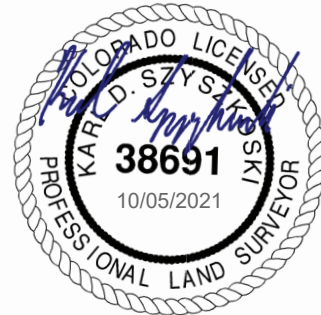
EXHIBIT ATTACHED AND MADE A PART HEREOF.