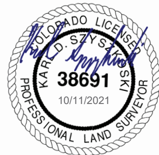
ILLUSTRATION ATTACHED AND MADE A PART HEREOF.